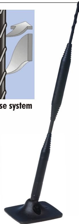
TYPICAL S.W.R. RESPONSE